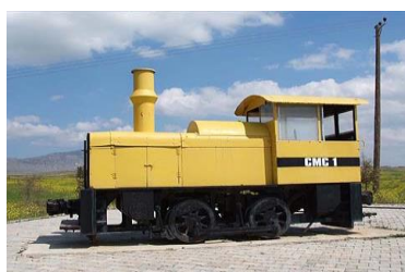
A talk on Cyprus Railways (Lunch optional)