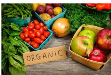
Guided Tour to Vouni & Organic Farm + Lunch

Additional events may also be included during this period, with details published on the Events 2021 Page of the association website.