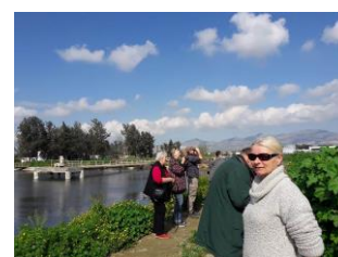
Guided Bird Watching Tour + Lunch