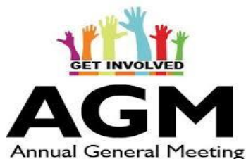
Association AGM (Lunch optional)

Events organised for the months January to June 2021 include those to: -