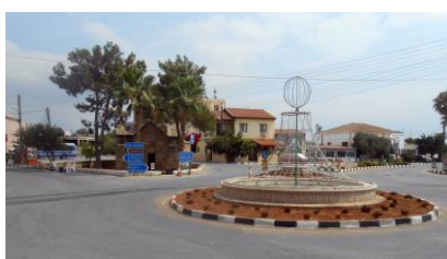
Guided walking Tour of Iskele + Lunch