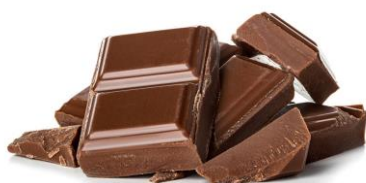
A visit to a Chocolate Maker + Lunch